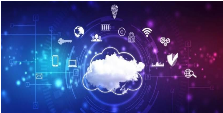
Innovative Cloud base solution

All these features are available with reporting capabilities and higher security standards. Solution helps customers widen their reach and reduce the cost of servicing while maintaining room for business customization without compromising performance.