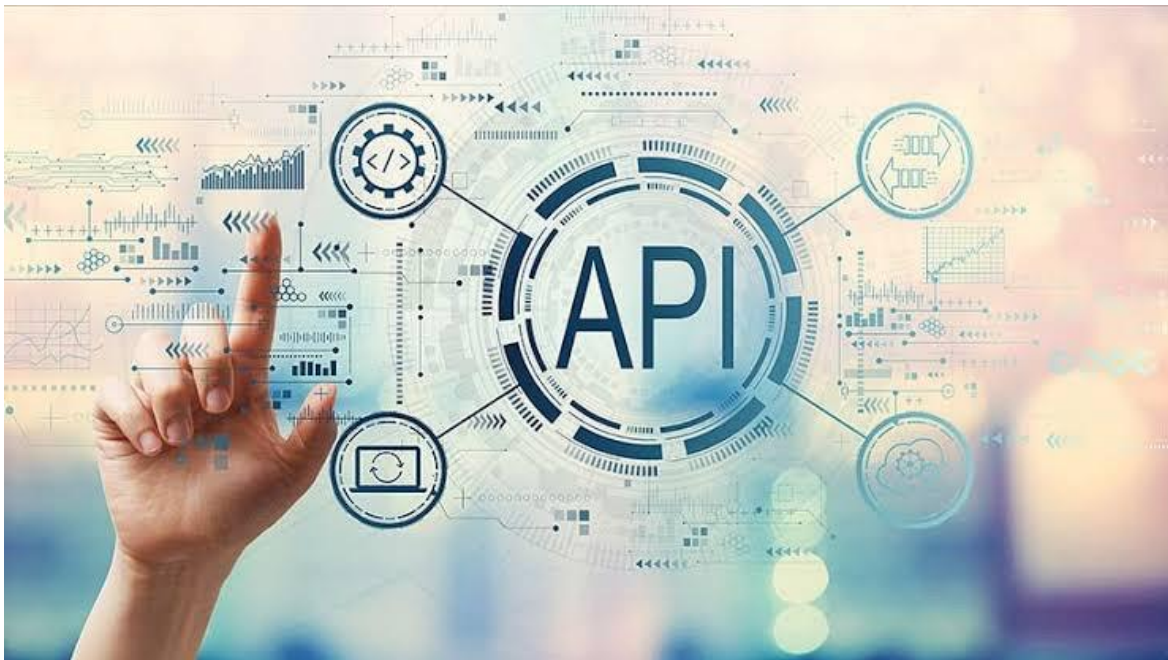
API enabled platform